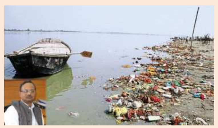
IIT, Kanpur develops new technology to control pollution in Ganga

https://newstrack.com/uttar-pradesh/kanpur/iit-kanpur-develops-new-technology-to-control-pollution-in-ganga/